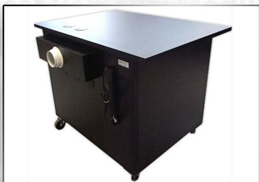
Heat Removal Module