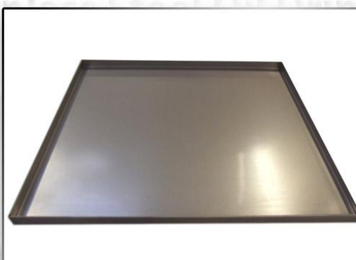
Stainless Steel Oil Drip Pan