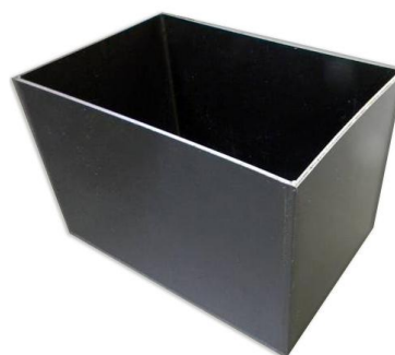
Solvent waste storage