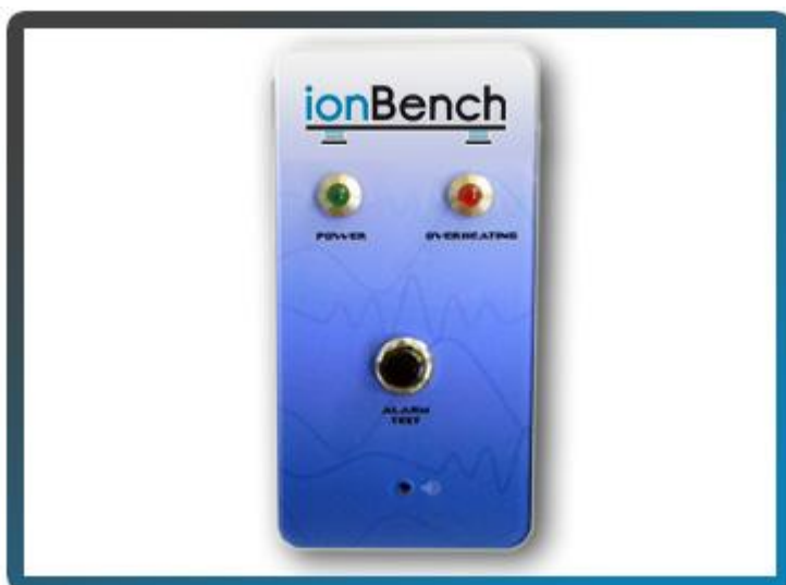
Overheating temperature alarm