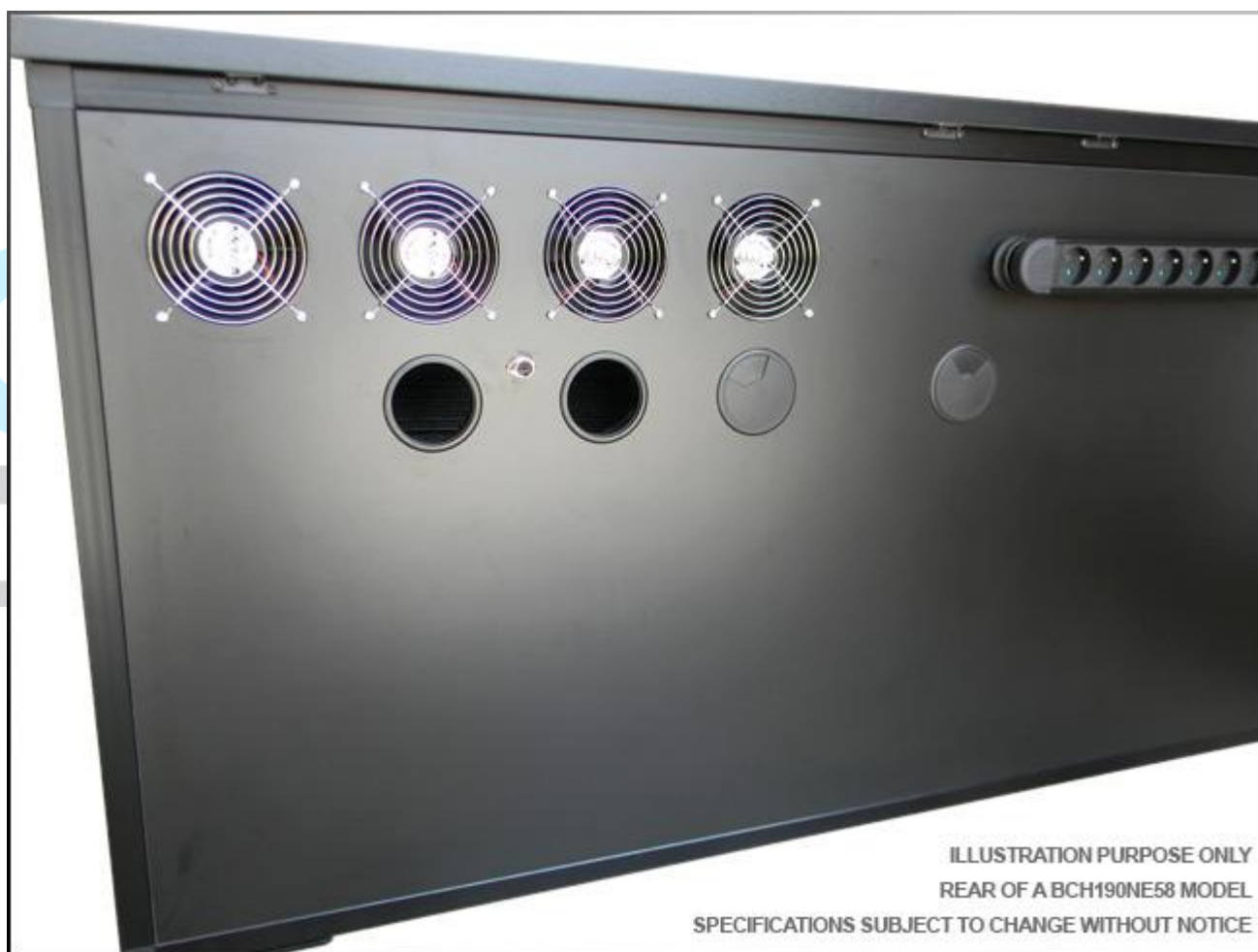
ILLUSTRATION PURPOSE ONLY REAR OF A BCH190NE58 MODEL SPECIFICATIONS SUBJECT TO CHANGE WITHOUT NOTICE