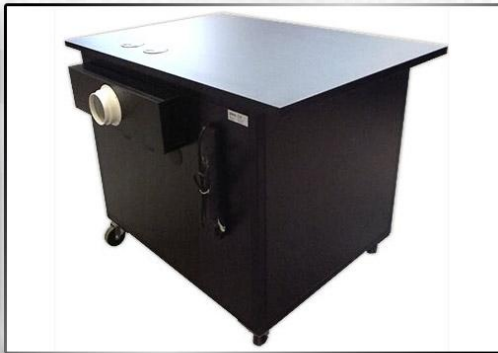
Heat Removal Module