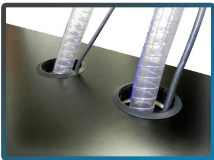
Pipe and cable management