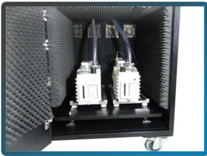
Noise enclosure for vacuum pumps