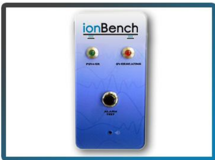
Overheating temperature alarm