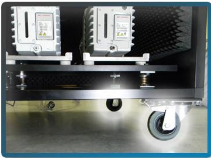
Fully movable bench

Fully movable bench with a weight capacity above 440 kg / 970 lbs and Chemical resistant worksurface for laboratory applications. Different bench sizes available depending the configuration of the LC/GC/MS. Black steel powder coated frame.